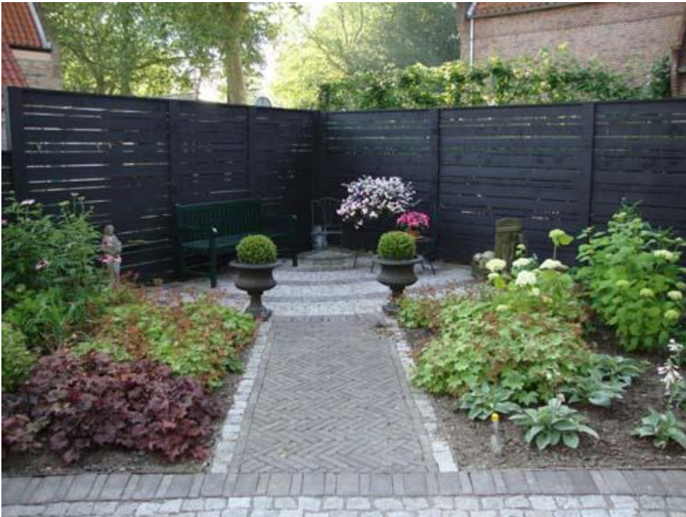
The mill garden.2.