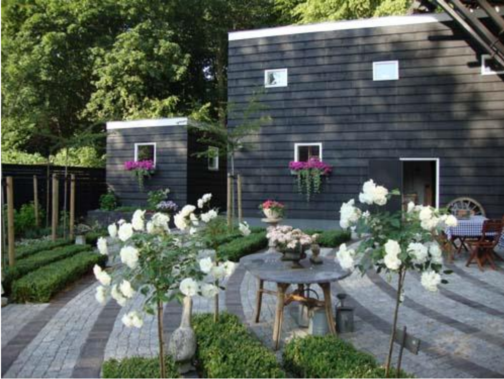
The mill garden.1.