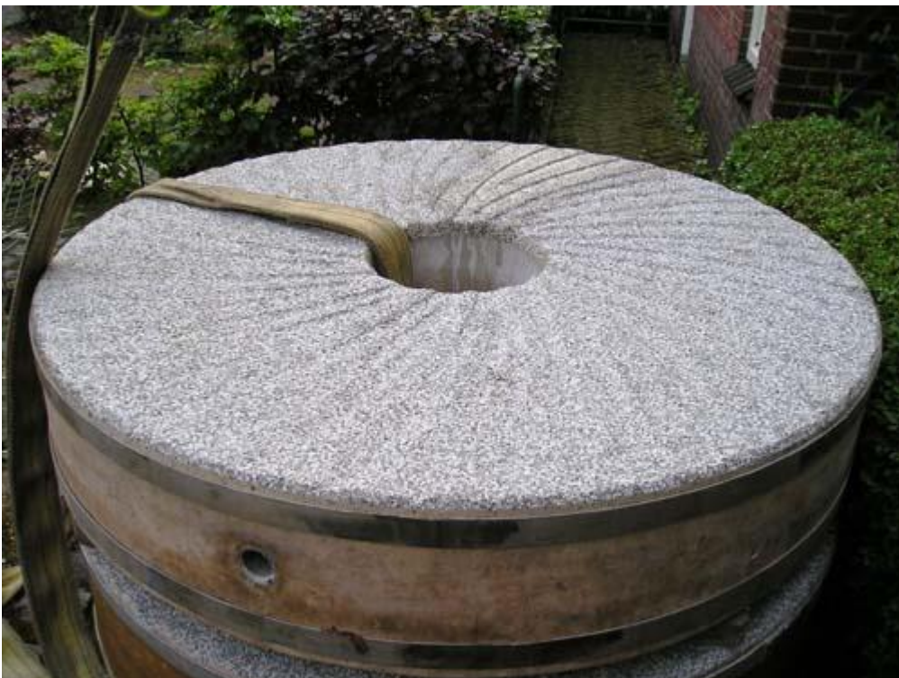
Set of new artificial stones.