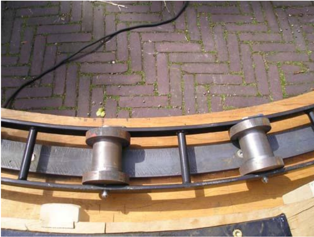
The English cap traveller.