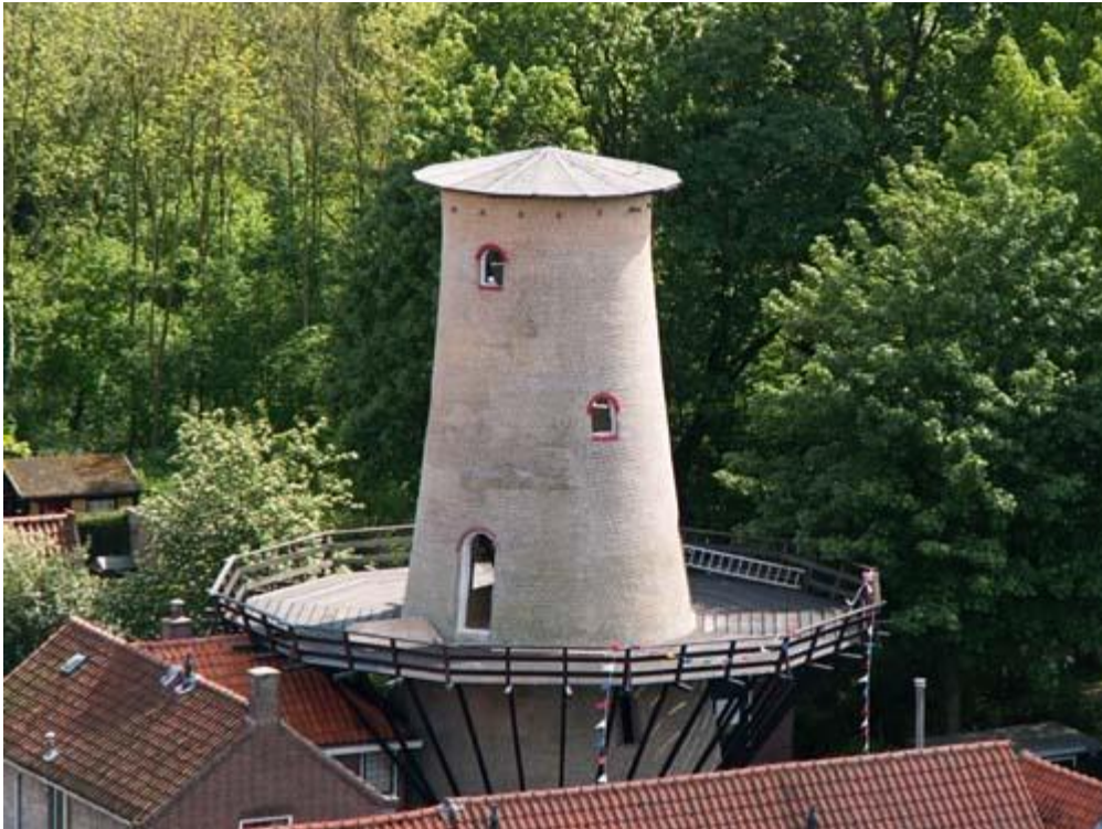
Restored bare hull. Beautiful to see the hull looks brand new after rebuilding en restoration all of the brickwork.