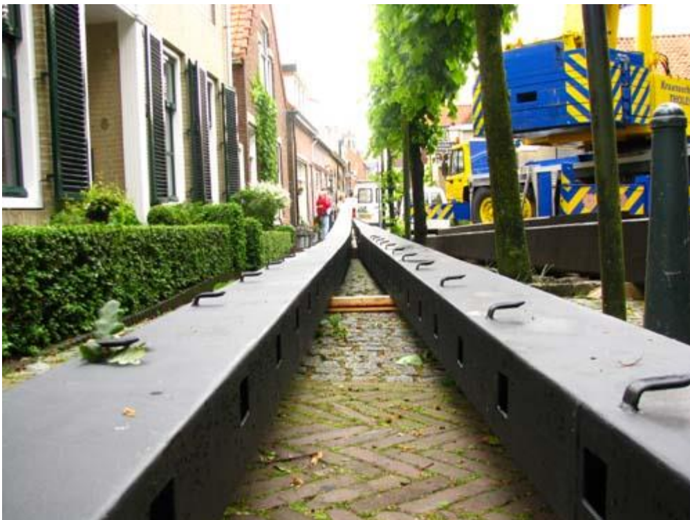
The two spars each 23,50 metres. Long.