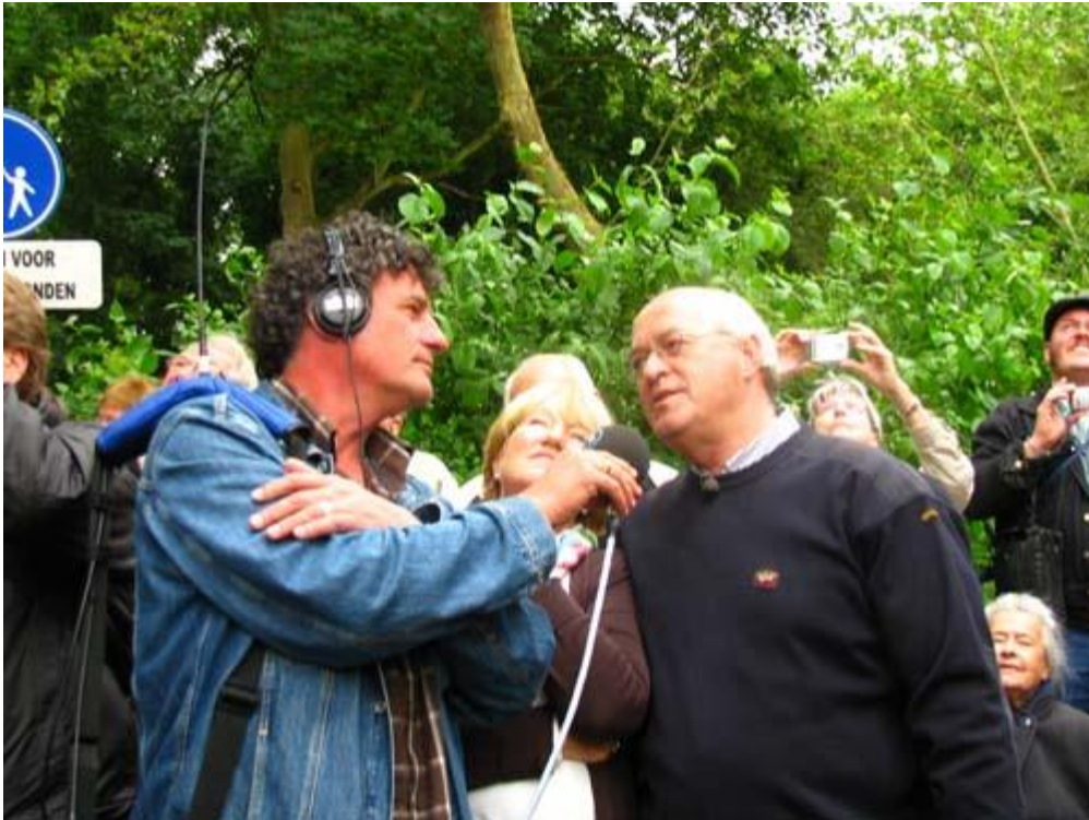
Many times television reporters were on the spot.