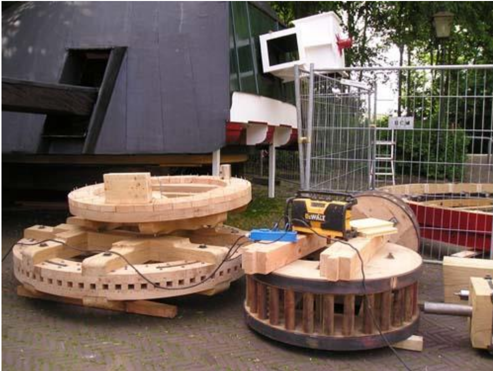
Lui table, spur wheel and upper traveller.