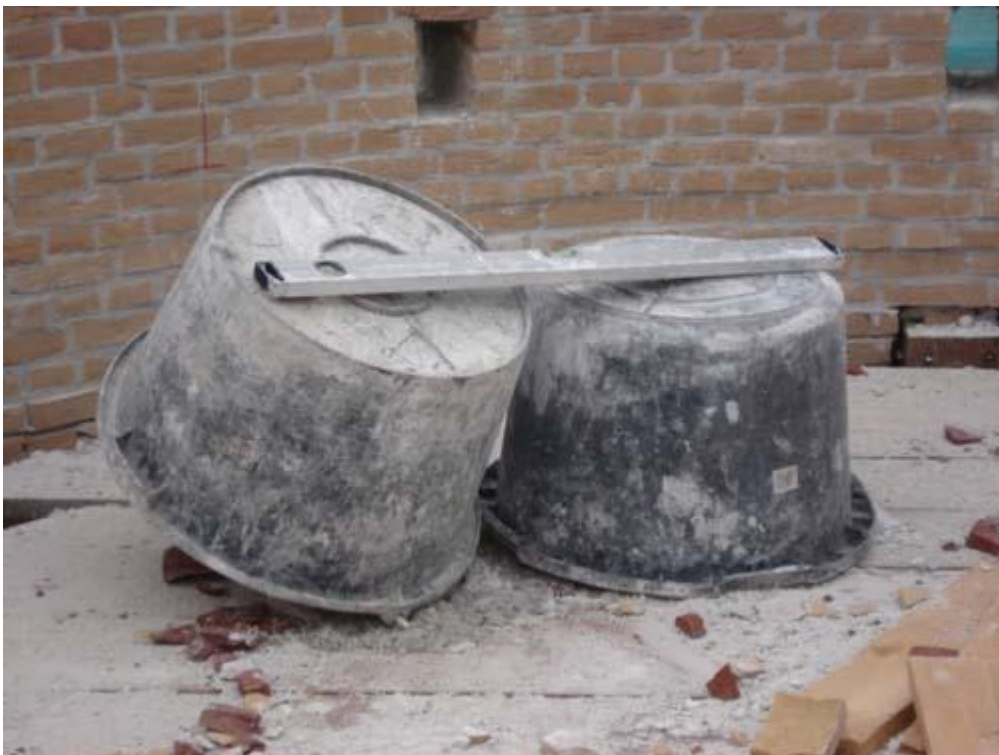
Time to rest for a while.