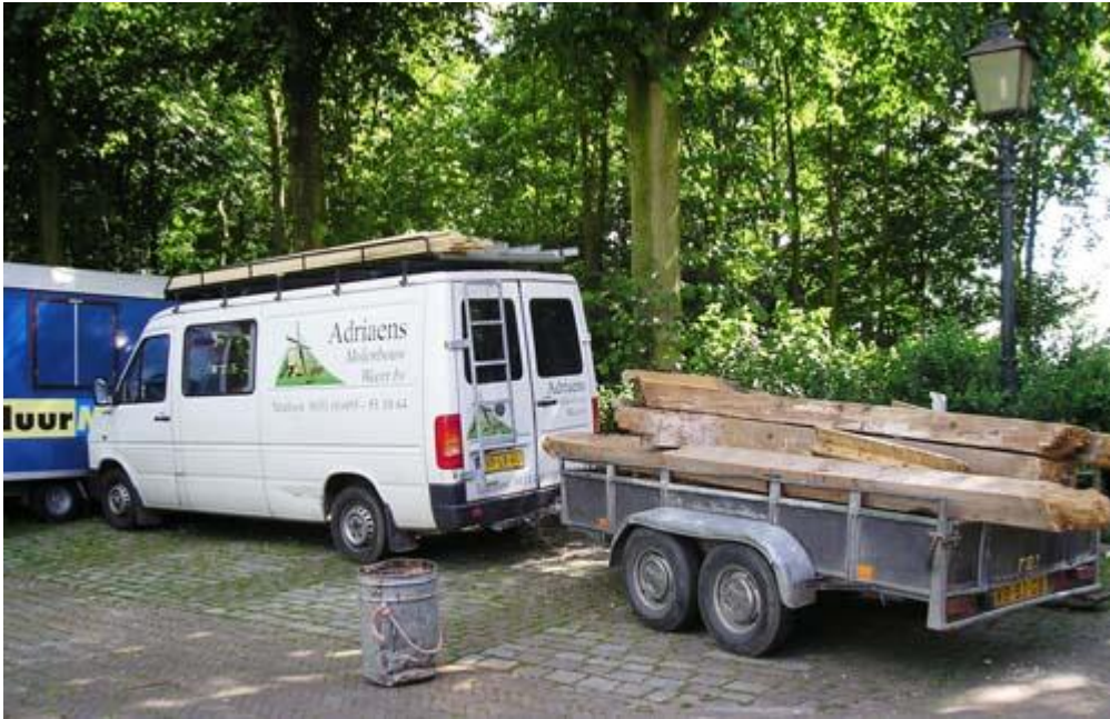
Adriaanse Molenbouw takes away remains.