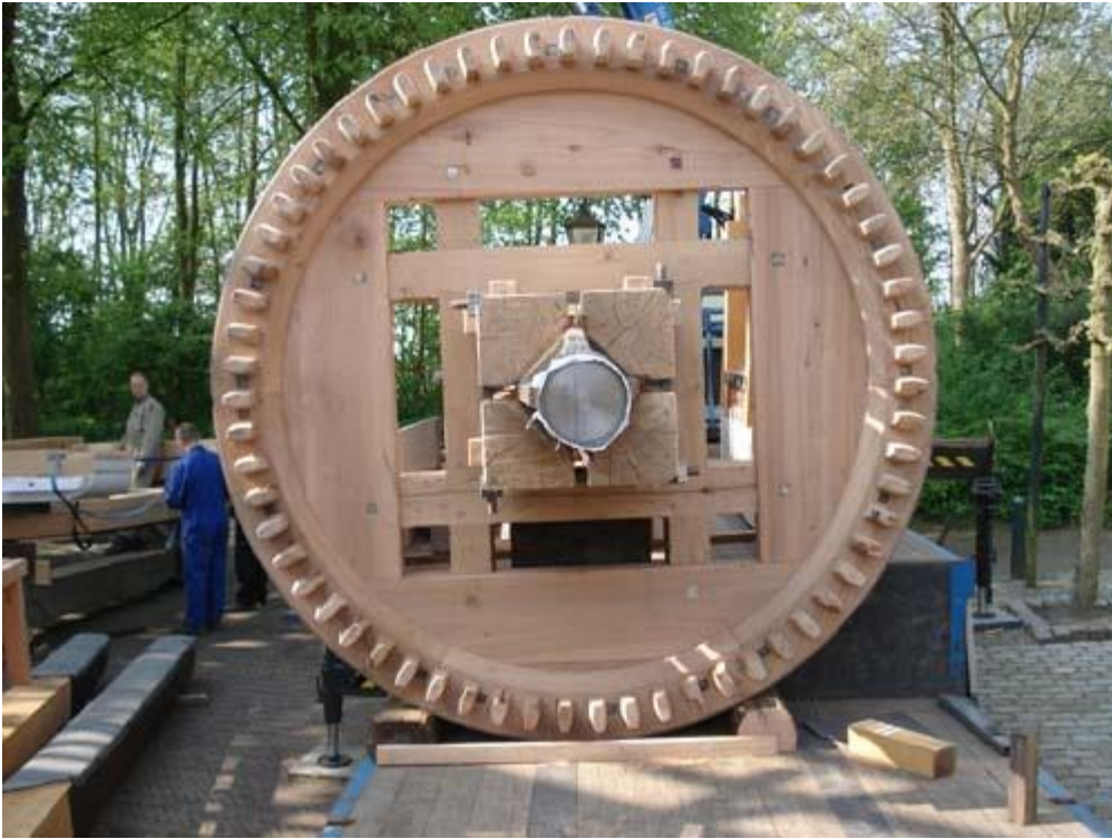
Upper or great spur Wheel.