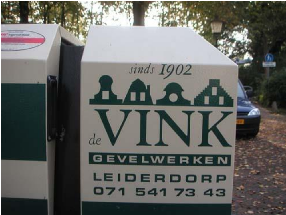
Gevelrestauratie de Vink.