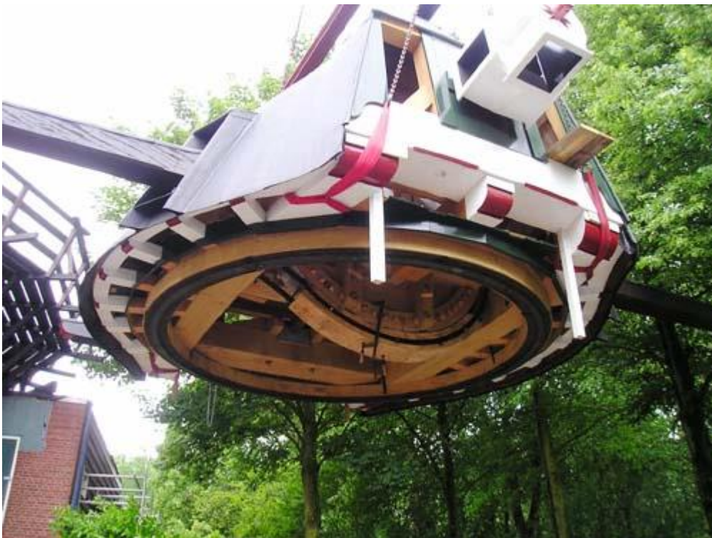
The cap is being placed.