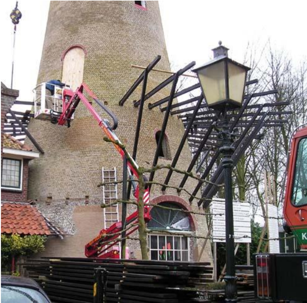
Start of constructing the stage. The big job started by placing the stage. The total repair works were carried out by Adriaens Molenbouw from Weert.