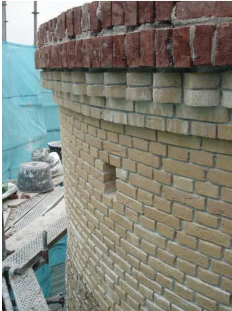
Completely renewed top side. One and a half meters from the top down was totally rebuilt inclusive the red brick roll and the so called mice teeth.